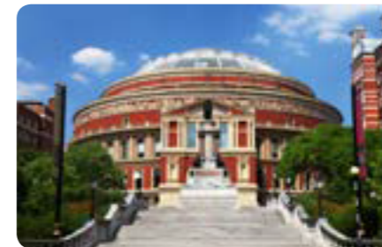
Royal Albert Hall