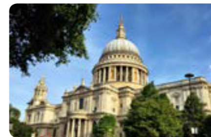
St Paul's Cathedral