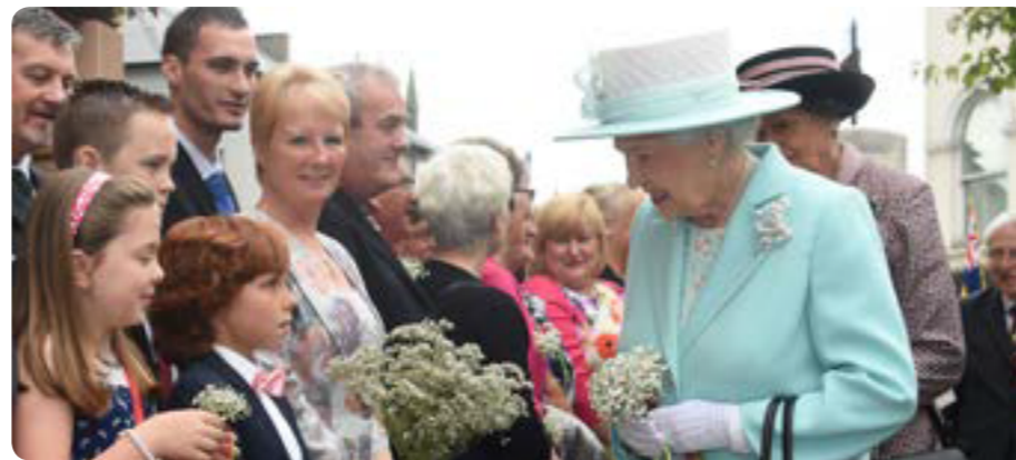
The Queen meets lots of people

Elizabeth II is the monarch of the United Kingdom. She was born in 1926 and became queen in 1952. She was married to Prince Philip and has a large family. She lives in Buckingham Palace in London. The Queen is very important. She visits charities and schools in the United Kingdom and welcomes world leaders to Buckingham Palace.